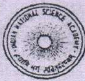
Indian National Science Academy New Delhi